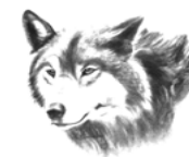
H. S. Truman MS Timberwolves